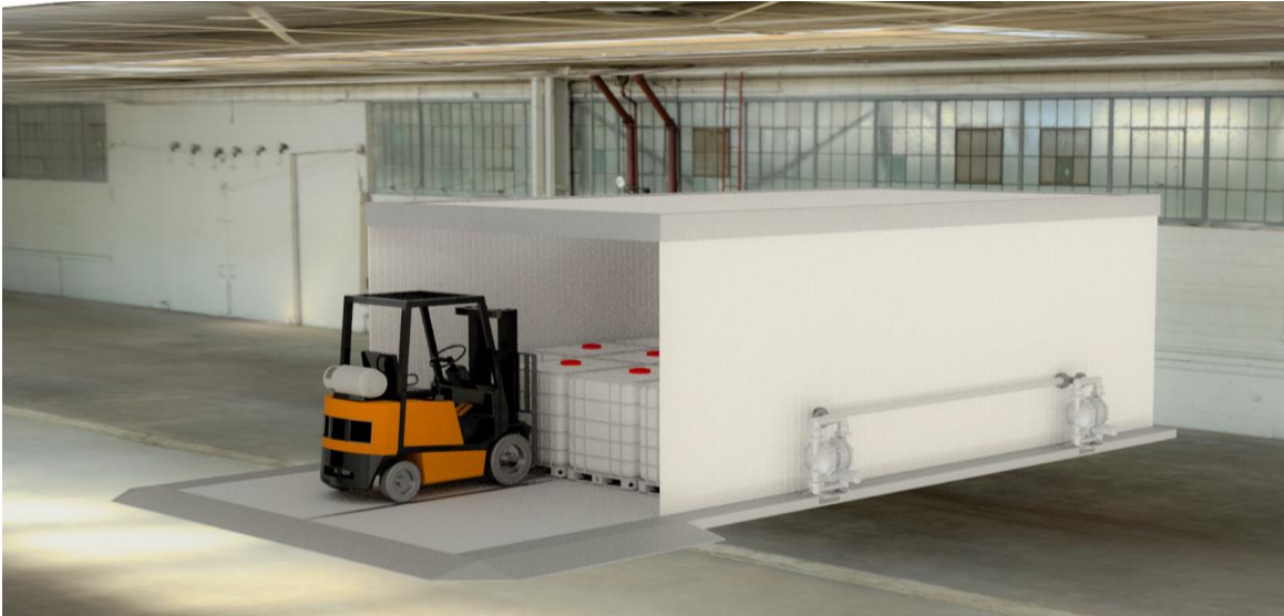
One-way access for units that need to be placed up against a wall.