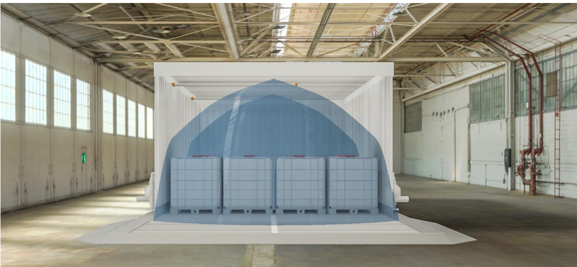
Deluge sprinkler system provides overall coverage to all the IBC totes.