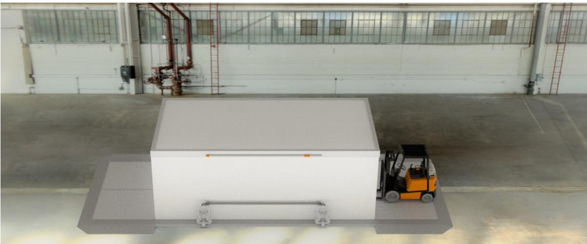
Top view of two-way access (discharge piping connection not shown)